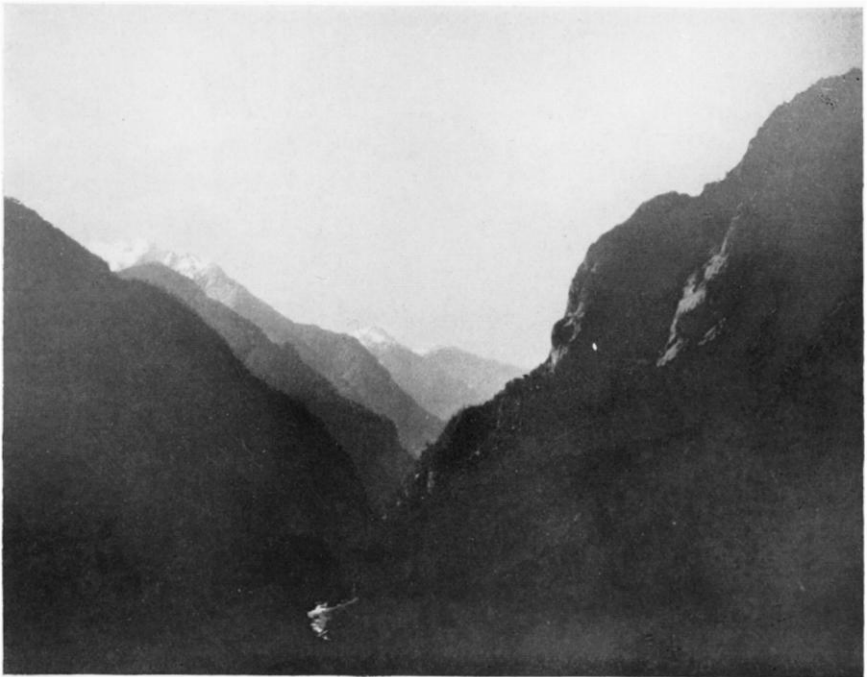
The Darma Gorge from near Nangling